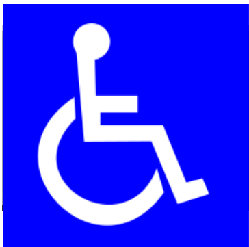
Wheelchair accessible vehicles will have the this symbol displayed

To ensure safe transportation it is important that wheelchairs are maintained in good operating condition; i.e. tires fully inflated, brakes operational, and wheels snugly in place. If a wheelchair is in need of repair, transportation may be put on hold until the deficiency is corrected.