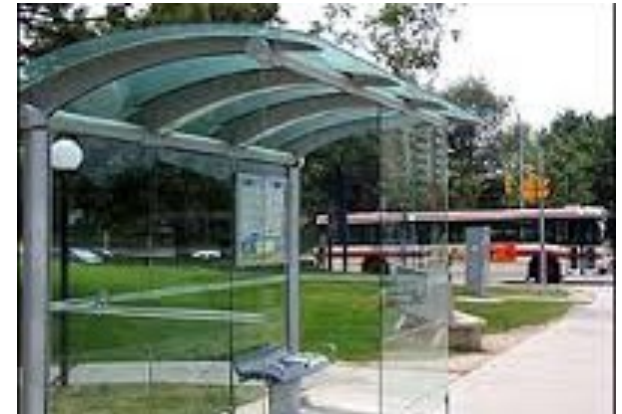
When waiting for the bus please respect both TTC and private property

Your child should now be ready to travel the route independently. After taking the trip a few times your child will not be apprehensive travelling the route alone and will move a step further on the road to independence.