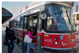
Watch for passing vehicles when de-boarding streetcars