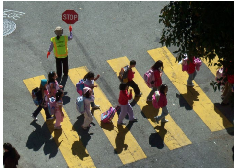
Toronto Student Transportation Group arranges transportation for 45,000 students daily